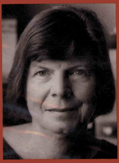
A Committee of the