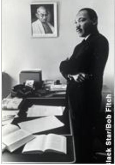
King and Gandhi embraced nonviolence both in principle and as strategy.

Armed resistance often backfires by legitimizing the use of repressive tactics. Violence from the opposition is often welcomed by authoritarian governments and even encouraged through the use of agents provocateurs, because it then justifies state repression. But state violence unleashed on unarmed dissidents often triggers a turning point in nonviolent struggles. A government attack against peaceful demonstrators can be the spark that transforms periodic protests into a full-scale insurrection.