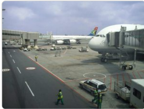
Airport Engineering mcqs

4. Assertion A : The ratio of arriving and departing aircrafts influences the airport capacity: Reason R :Landing operation is generally given priority over the taking off operation.